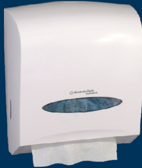
WINDOWS® Series-i Folded Paper Towel Dispenser Product Code : 02010