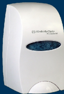
WINDOWS® Series-i Skin Care Dispenser 500 ml. Product Code : 02004

Kimberly-Clark Hygiene Products Private Limited Survey No. 279, Rasoni Industrial Park, Village - Mann, Taluka - Mulshi, Dist - Pune - 411 057, India. Tel.: +91-20-22939121 - 24 Fax : +91-20-22939118 E-mail : marketing.india@kcc.com Website : www.kcprofessional.com