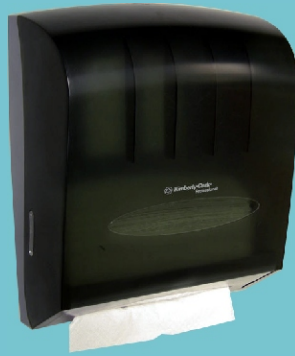
IN-SIGHT* Series-i Folded Paper Towel Dispenser Product Code : 02002