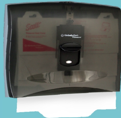
IN-SIGHT* Series-i Personal Seat Cover Dispenser Product Code : 02003