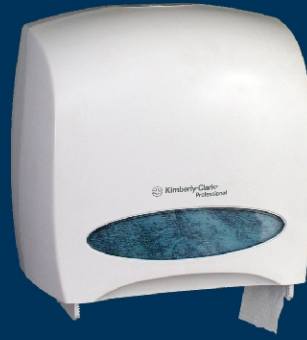
WINDOWS® Series-i Jumbo Roll Tissue Dispenser Product Code : 01307