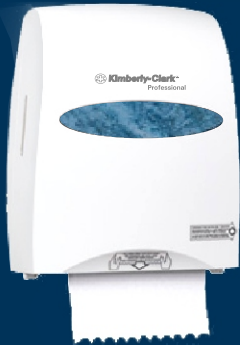
WINDOWS® Series-i Hard Roll Towel Dispenser Product Code : 02007