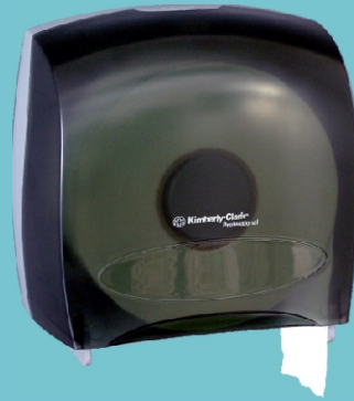
IN-SIGHT* Series-i Jumbo Roll Tissue Dispenser Product Code : 02001