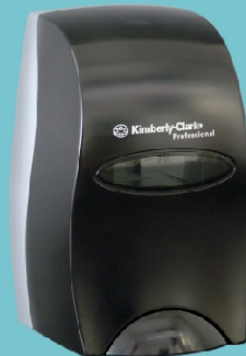
IN-SIGHT* Series-i Skin Care Dispenser 500 ml. Product Code : 02005