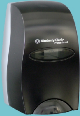
IN-SIGHT* Series-i Skin Care Dispenser 800 ml. Product Code : 02006