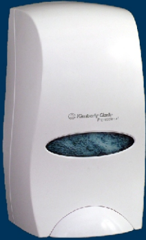
WINDOWS® Series-i Skin Care Dispenser 800 ml. Product Code : 01261