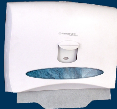
WINDOWS® Series-i Personal Seat Cover Dispenser Product Code : 01260