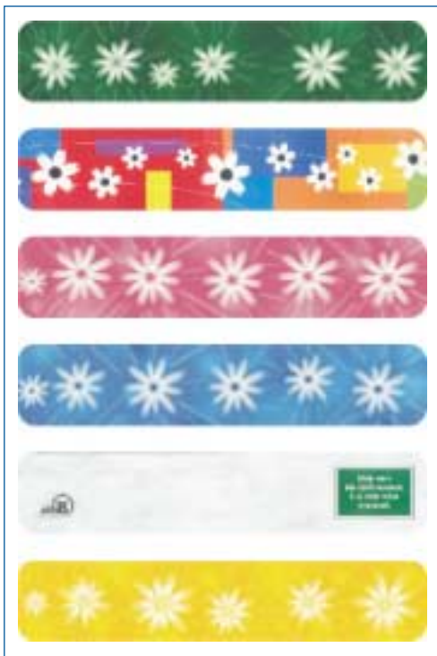
Distinctive 'Deco-Strip' feature allows you to customise the sleek and attractive dispenser according to your washroom décor.