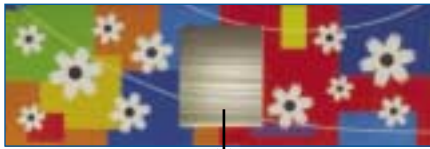
Internationally acclaimed 'WINDOWS' feature enables the staff to monitor refill levels at-a-glance.